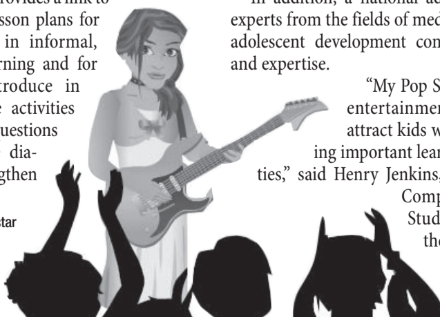
A user-created pop star entertains the crowd in a screen shot taken from mypoastudio.com .

critical thinking and communication skills.