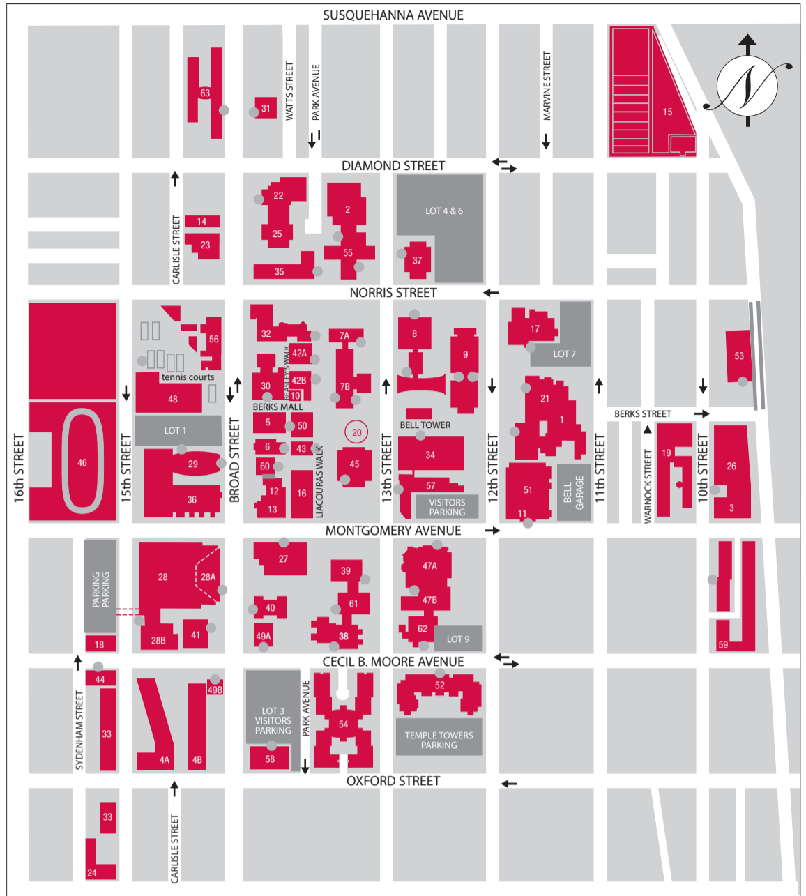
● Wheelchair Access